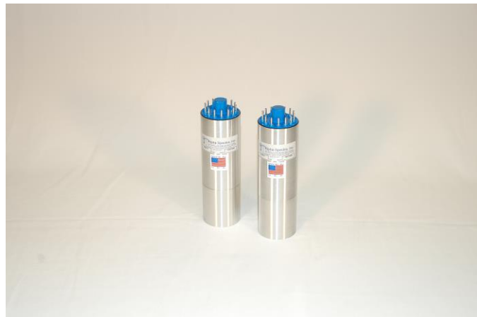
Figure 1. BGO crystal blank.

We fabricate many different configurations including: crystal blanks, open face, thin, thin integral, demountable, side well, end well, environmental, ruggedized or annular types. Look at our photo gallery to see many of these designs.